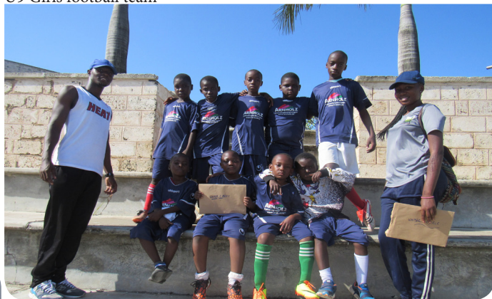
U9 boys football team