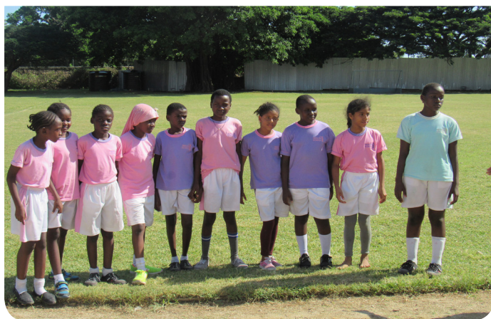
U9 Girls football team