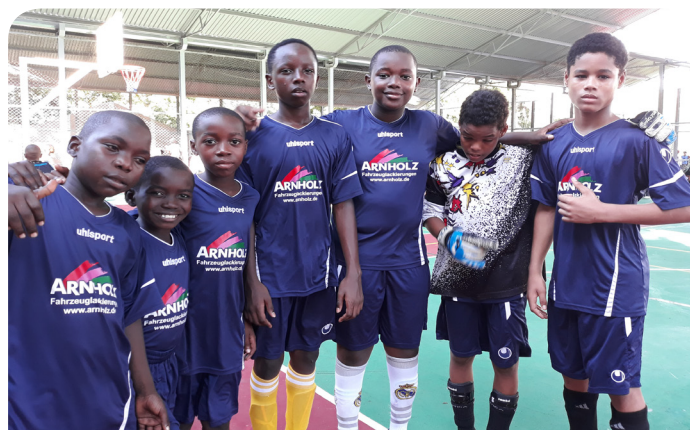
U13 Boys football team

The KG classes also had a chance to showcase their athleticism during the inter-nursery athletics held at Oshwal Academy on the 23rd of June.