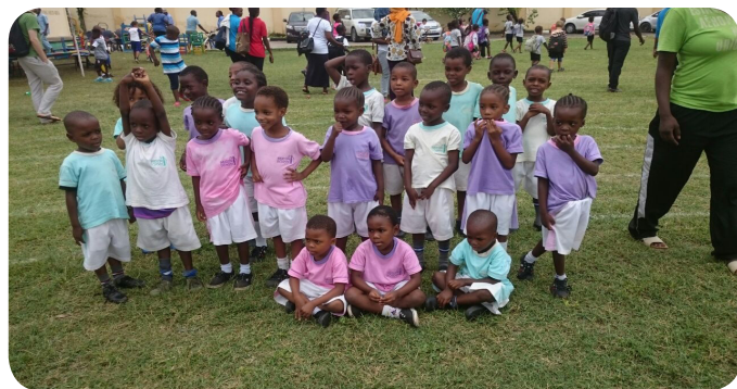
KG's attend inter-nursery games at Oshwal