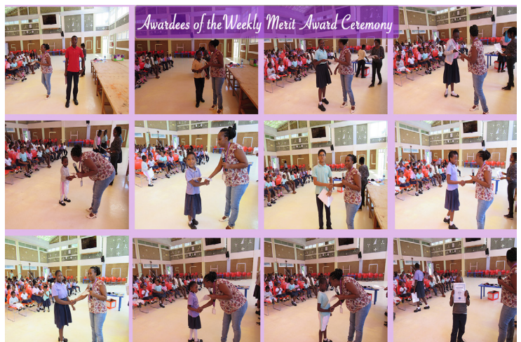
Other merit awardees during the term